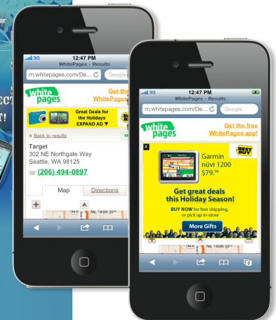
Rich Media expandable ads