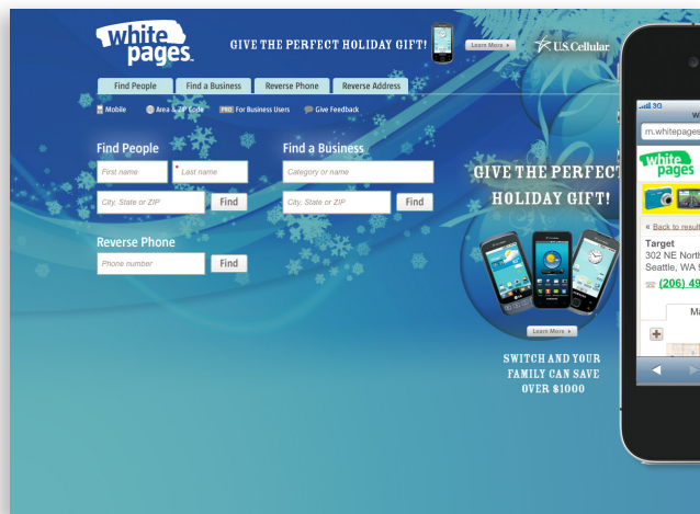
Home page skin ~50 Million home page visits